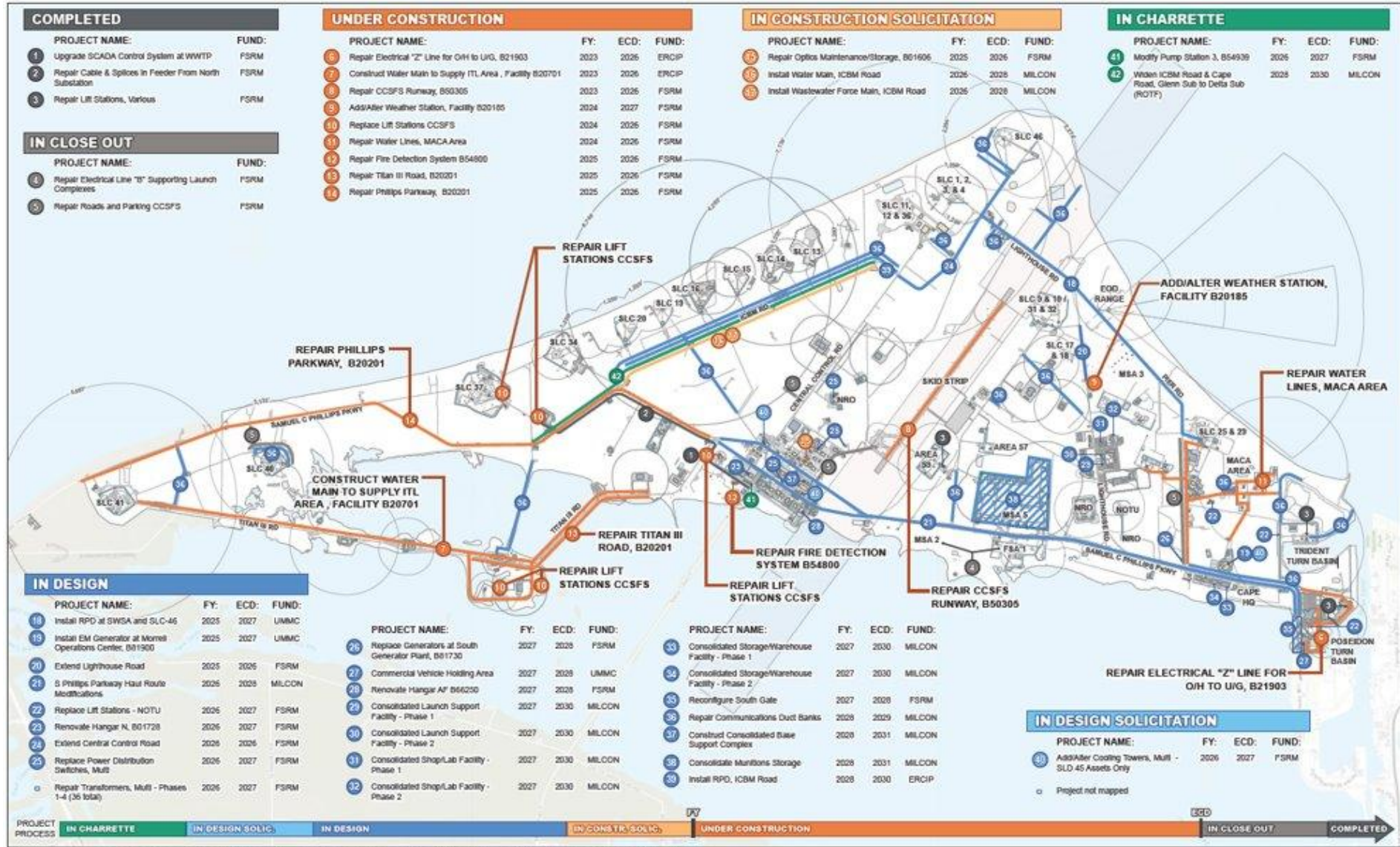
CAPE CANAVERAL SPACE FORCE STATION | SPACEPORT OF THE FUTURE SPOFTI ACTIVE PROJECT LOCATION & STATUS MAP (10/07/2025)